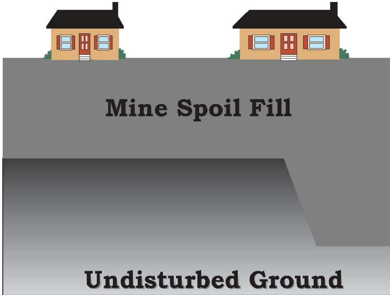
Figure 1. Settlement of underlying mine spoils can affect buildings constructed on mine spoil fills. The spoil depth under Building A is relatively uniform, whereas Building B is built over an area where spoil depth varies. Building B is more likely to be damaged due to differential settlement because of variations in the depth of the underlying spoils and because it covers a larger lateral area.

settlement, especially deep-seated settlement, and may comprise a significant part of the total structural distortion.